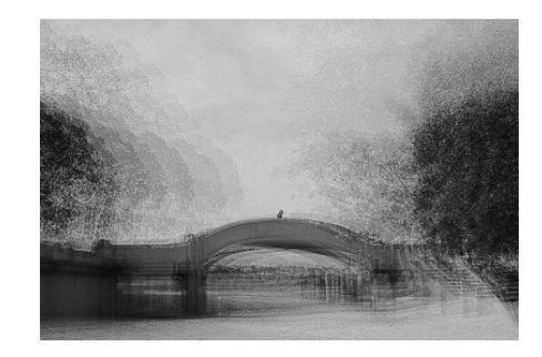
Balmoral Bridge Credit - Set Subject Rosie Steggles