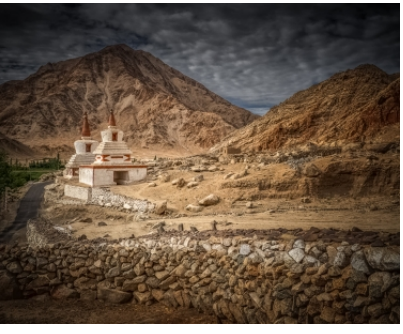
Two Stupas Ladakh