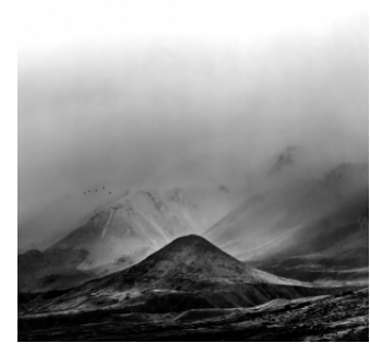
Mount Sunday In Fog Merit - Open Sara Corlis