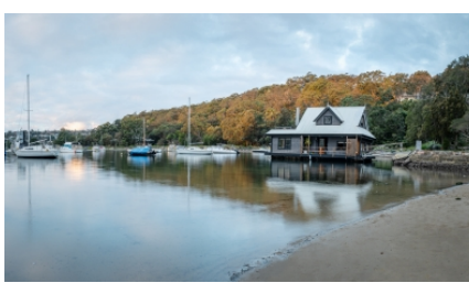
The last house boat Credit - Set Subject Fujiko Watt