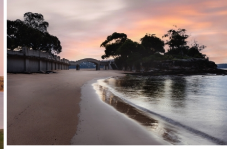
Rocky Point Island Bridge Credit - Set Subject Cushla Monk