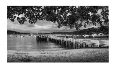
Balmoral Wharf Credit - Set Subject Fujiko Watt