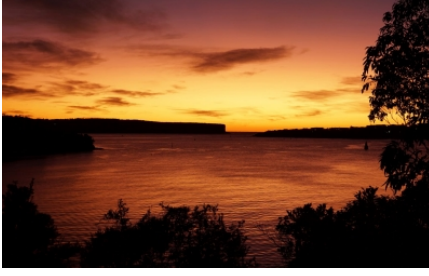
Four Headlands Credit - Set Subject Jennifer Blaikie