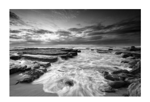
Gully Flow Merit - Set Subject Phil Cargill