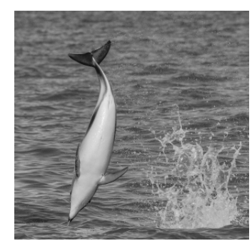
Dusky leaping