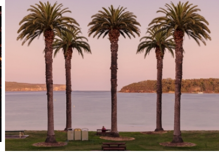
Mosman Views Credit - Set Subject Rosie Steggles