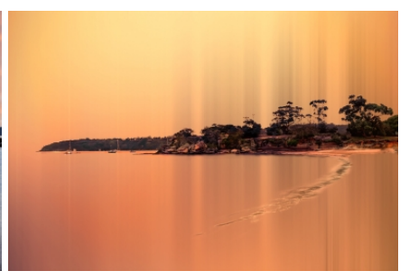
Balmoral Island Acceptance Louise Scambler