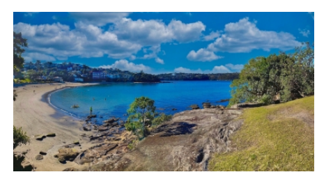
Balmoral view