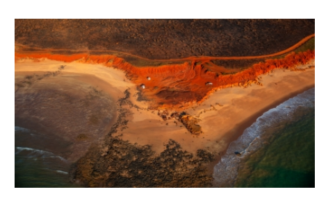
Red Sands Credit - Open Denise Petrie