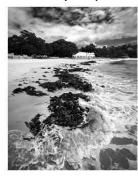
After the Storm Credit - Set Subject Arnold Vogel