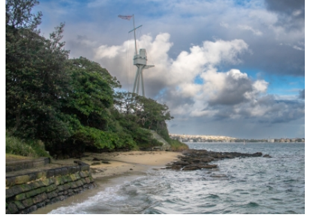
Approaching Storm Credit - Set Subject Terry Daley