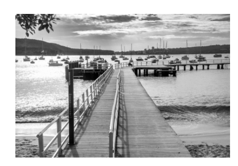
Balmoral Baths Credit - Set Subject Terry Daley