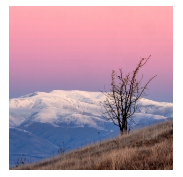
The Slope Up Merit - Open Sara Corlis