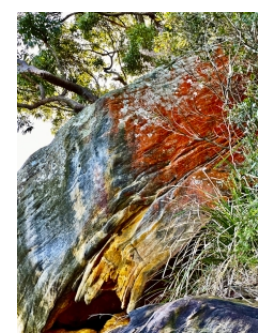
Athol Beach 1 Acceptance Vera Robinson